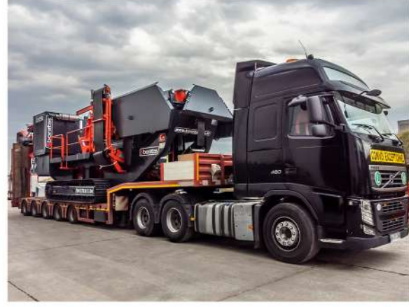
EASY TO TRANSPORT DUE TO FOLDABALITY